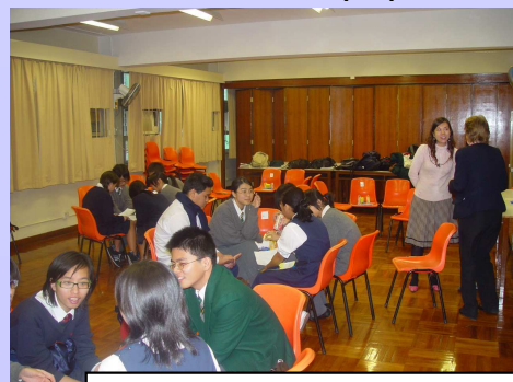
Our students deep in conversation