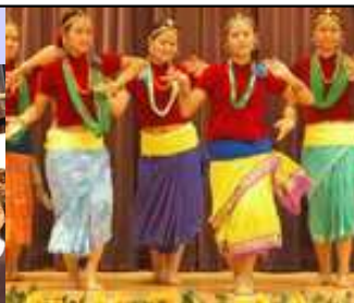
The Oriental Dance Team performing