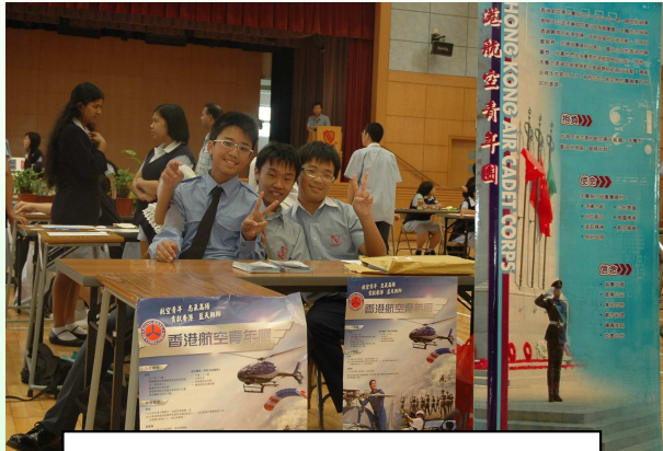
Come and join the 601 Squadron

Learning is not just confined to books. Students today have to learn to be resourceful and versatile in facing adversity and getting around obstacles in life. It has been a long-established policy of Sir Ellis Kadoorie Secondary School (West Kowloon) to focus not just on the academic development of students but also on extra-curricular activities (ECA) with the aim of cultivating students in an all-round manner. Extra-curricular activities have been generally recognized as fundamental to leadership training and multiple intelligence development. To cater for students' diversified interests, the ECA Committee offers a wide range of club activities to students again this year.