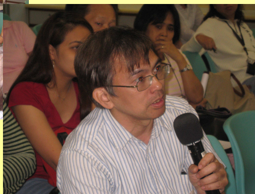
Sharing with other parents