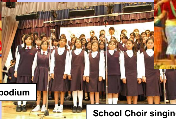
School Choir singing