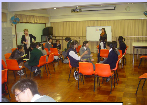
Gearing up for group interaction