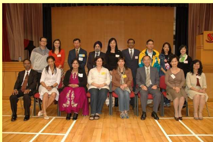
PTA Executive Committee Members, 2007-2008

After a spot of refreshments, parents dispersed to the various venues to meet Class Teachers and to check on the performance and progress of their respective children, who might or might not have been dreading the first term report sheets falling into their parents' hands!