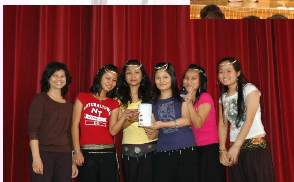
Ms Yuen poses with “Leja leja re” girls