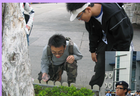
Biology field trip