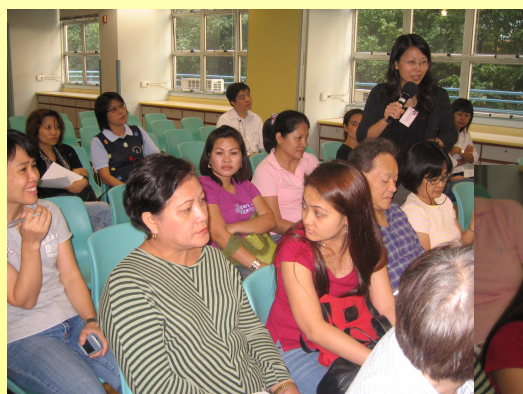
Parenting talk by the School Social Worker

Always bear in mind that your children are starting a new chapter in life in which your love, your patience, your tolerance and your understanding would mean a lot to them. Open up your mind to the new adventures they are taking and offer them assistance at the right moment. It is then through parents' guidance and support that they will mature gradually.