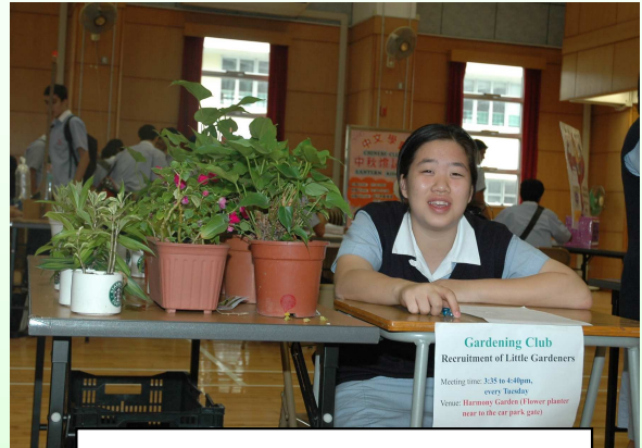
Recruitment of Little Gardeners

Currently the school has 38 clubs or teams, which can be divided into 4 categories: academic, interests, sports and service. The academic clubs are geared particularly to give students knowledge supplemental to their study in particular subject areas. Students who are more energetic can participate in sports clubs or dance teams to burn off their boundless energy. For students who like to devote themselves to serving the community, the Hong Kong Air Cadet Corps or Social Service Club is perfectly tailored for them. Other clubs teach real-world skills such as photography, handicraft and cookery, all of which might develop into lifelong interests or even future careers.